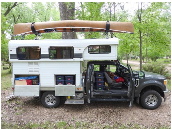
New truck camper, raised for camping (above), and lowered for travel (below).

Total solar eclipse, Aug. 17, 2017, Oregon.